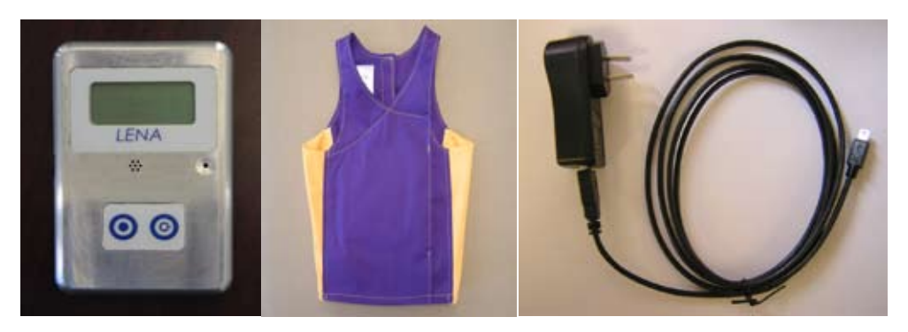
Figure 1. LENA DLP Prototype, Charger, and Vest Used by Study Participants

Phase II participants recorded with an early prototype of the LENA digital language processor (DLP). This DLP prototype (see Figure 1) weighed 2.5 ounces. In order for the battery to run for a full day, the LENA DLP required charging for at least four hours using the LENA charger (Figure 1). Participants were sent LENA vests to wear on their recording days (Figure 1). The LENA DLP slipped into the front pocket of the LENA vest.